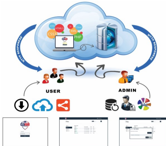
Fig. 3. (Communication)