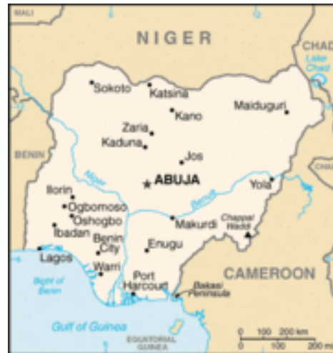
Fig.1. Map of Nigeria showing neighboring Countries.

Years of neglect of both the rolling stock and the right-of-way have seriously reduced the capacity and utility of the system. A project to restore Nigeria's railways is now underway. A project to convert the gauge of the system to 1435 mm has also somewhat stalled. Couplings of the chopper kind , vacuum brakes and non-roller bearing plain axles are also obsolete.