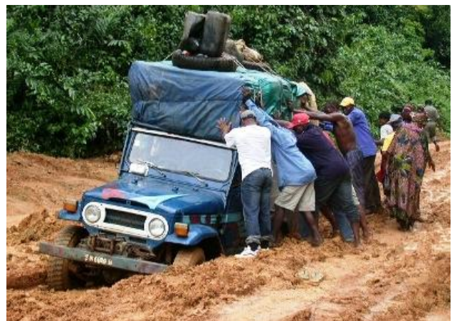
Fig.3. Dangers of poor road maintenance.

driving through the median to cross into oncoming traffic in order to make a left turn. It is also common for many breakdowns. Drivers uproot small clumps of vegetation from the ditches and place them on the roadway in order to warn traffic to merge around the stalled vehicle much like triangular warning signs used by truck drivers in the U.S. Drivers passing the stalled vehicle often create a slowdown. Other drivers avoid this slowdown by driving through the median, often a small ditch 2- or 3-feet deep, and proceeding along the left shoulder of oncoming traffic. If oncoming traffic is thin, the drivers often drive in the inside lane. Those oncoming vehicles must then merge into the right lane and/or the outside shoulder. Once past the obstruction the cars are driven back through the median to the correct side of the road.