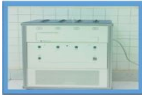
Fig. 3. Pour point refrigerator