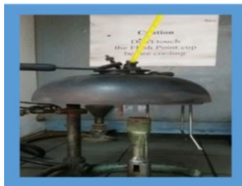
Fig. 5. Flash point

The flash point temperature is one measure of the tendency of the test specimen to form a flammable mixture with air under controlled conditions. It is one of the properties that must be considered in assessing the overall flammability hazard of a material. It measures and describes the properties of materials, products in response to heat and an ignition source under controlled conditions. The result of the test may be used for risk assessment which takes into account all factors that are pertinent to an assessment of the fire hazards of a particular end use. Using ASTM D 93.