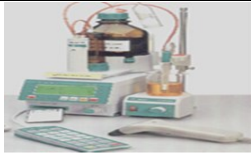
Fig. 6. Titro785