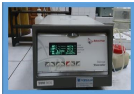
Fig. 2. Stabinger Viscomete

The viscosity was tested using a stabinger Viscometer at 40 and 100oC and VI respectively in the laboratory. Viscosity index showed the characteristic of the lubricants viscosities when temperature changes were applied. Using ASTM D 7042.