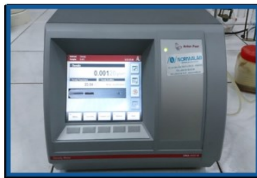
Fig. 4. Digital density meter

The density is test using a density meter at 15 °C. Using ASTM 4052.