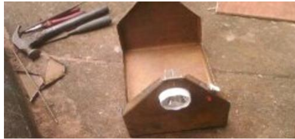
Fig. 2. Machine bed construction of a prototype inflator.

Although, some components were gotten off the shelf with respect to design specification such as electric dc motor, piston - cylinder arrangement, gear, delivery hose, cigarette lighter, plug etc. however, other components were manufactured and processed to specification with figure 1 below showing the construction of the machine bed with a manually operated touch light to aid night vision.