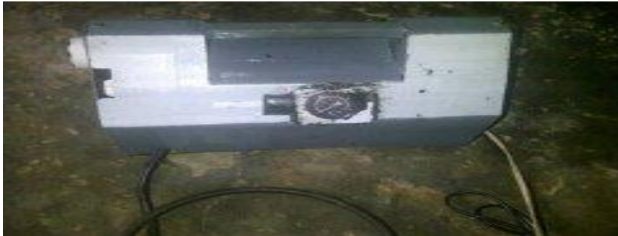
Fig. 5. A pictorial view of a closed fabricated prototype tire inflator with pressure gauge.