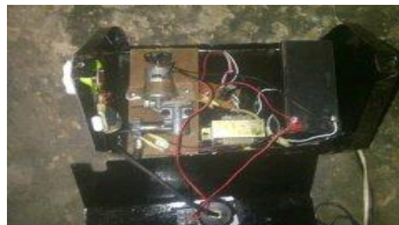
Fig. 3. A pictorial view of the open prototype tyre inflator.

The device was assembled and power was supplied via the 12 volt cigarette port in a car to pump a deflated non punctured for a period of 3 to 5 minutes in order to certify that the various components that makes up the device were functioning properly. It was observed that the machine delivered pressurized air of 209kpa (30.1psi), with a mass flow rate of m = 7.09 \times 10^{-6} \text{ kg/s} and a volumetric flow rate of V_D = 3.55 \times 10^{-2} \text{ m}^3/\text{s} during the said time interval. The volumetric efficiency was also evaluated to give 0.85 about 85% which shows more air is been used in the piston compression stroke. The compressor volumetric efficiency depends directly on the cylinder piston displacement. Figure 2 shows a pictorial view of open prototype tyre inflator showing the various parts and the arrangements of components. Figure 3 shows an assembly drawing of the prototype inflator. Figure 4 shows the fabricated prototype tyre inflator with an external hose (1 yard), 3mm in diameter connected to the device to deliver pressurized air to the car tyre, inflatables.