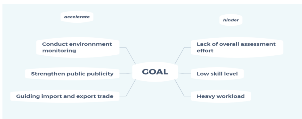
Fig. 2. Impact factors related to the goal.