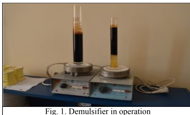
Fig. 1. Demulsifier in operation

The samples were prepared in the graduated cylinders in amount of 100 ml each. Then we injected determined quantities of demulsifier into each sample (0.005 – 1.0 ml). The process of demulsification lasted at T=20-22^\circ\text{C} during 30-40 minutes resulting origination of two separated phases: the upper phase of oil and the lower phase of water (fig. 1)